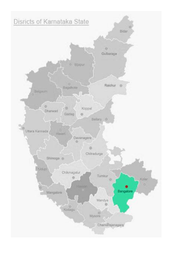
Figure 2 – Location of Bangalore

although this is down from nearly 66% in 2001, indicating increasing urbanization in the region. The literacy rate in the state is 75.6% (Government of India, Ministry of Home Affairs, 2011). The sex ratio is one of the most balanced in the country (968 females for every 1,000 males) in comparison with the national sex ratio (933 females for every 1,000 males). The Gender Equity Index (GEI) for education enrolment in Karnataka in