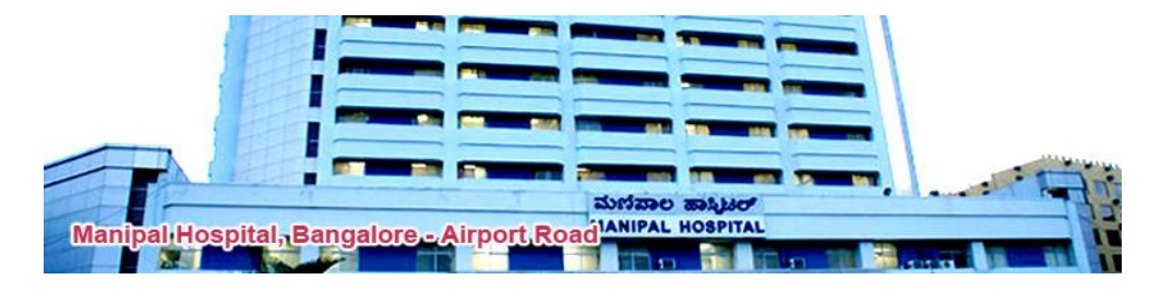
Figure 10 - Manipal Hospital

the hospital was bilingual, in both English and Kannada. Various faculties were listed but there was no list of doctors. The facility caters to all the major specialties, and is privately-owned by the TMA Pai Foundation.