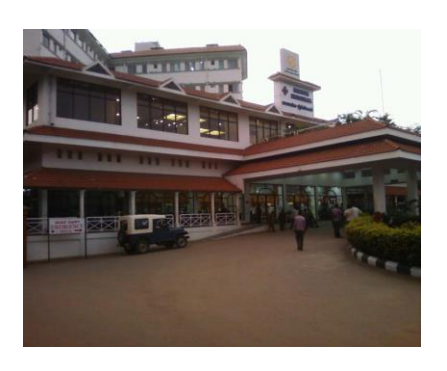
Figure 11 - Narayana Hrudayalaya Hospital

Narayana Hrudayalaya, located near the border of Karnataka and Tamil Nadu, is a large, privately-owned hospital complex with 3000 beds, and an 80 bed ICU. This facility was built in 2001, and became known for its cardiac care service, 'Hrudaya' in Kannada translates to 'heart'. Chairman,