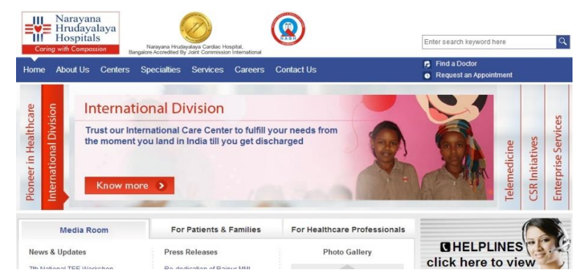
Figure 12 - International Division, Narayana Health

cases to units depending on the required treatment. The facility has a unique marketing strategy, including telemedicine connectivity established with 52 cities in Africa and 450 telemedicine centers