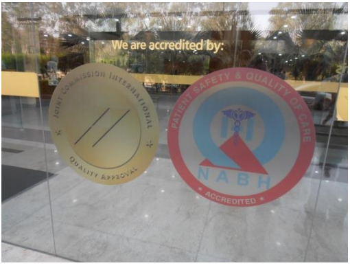
Figure 6 - Accreditations, Fortis Hospital

Fortis Hospital has a strong referral system which works both domestically and internationally. Since Fortis was initially part